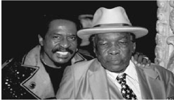
Clarksdale's Own: Ike Turner and John Lee Hooker

In conjunction with the Festival's theme, the Museum is offering a limited edition photograph of Clarksdale native sons Turner and John Lee Hooker. See Gift Shop for purchase details.